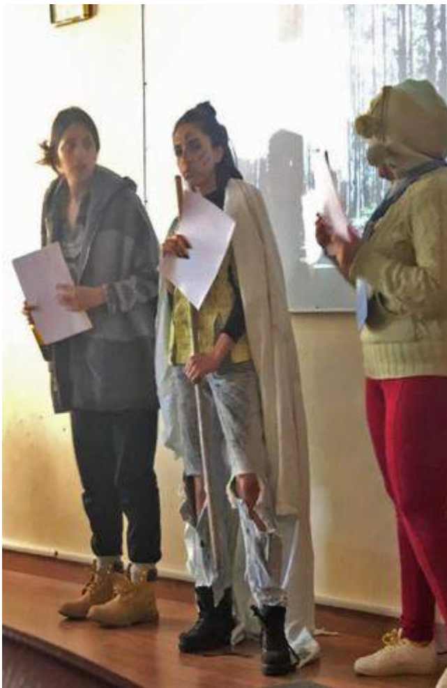
Student Role Play in Class.

Since our learning and teaching strategies promote collaboration and mutual exchange of ideas, assessment involves unseen written exams, computer-assisted assessments, coursework assignments, essays, oral presentations and research projects/papers.