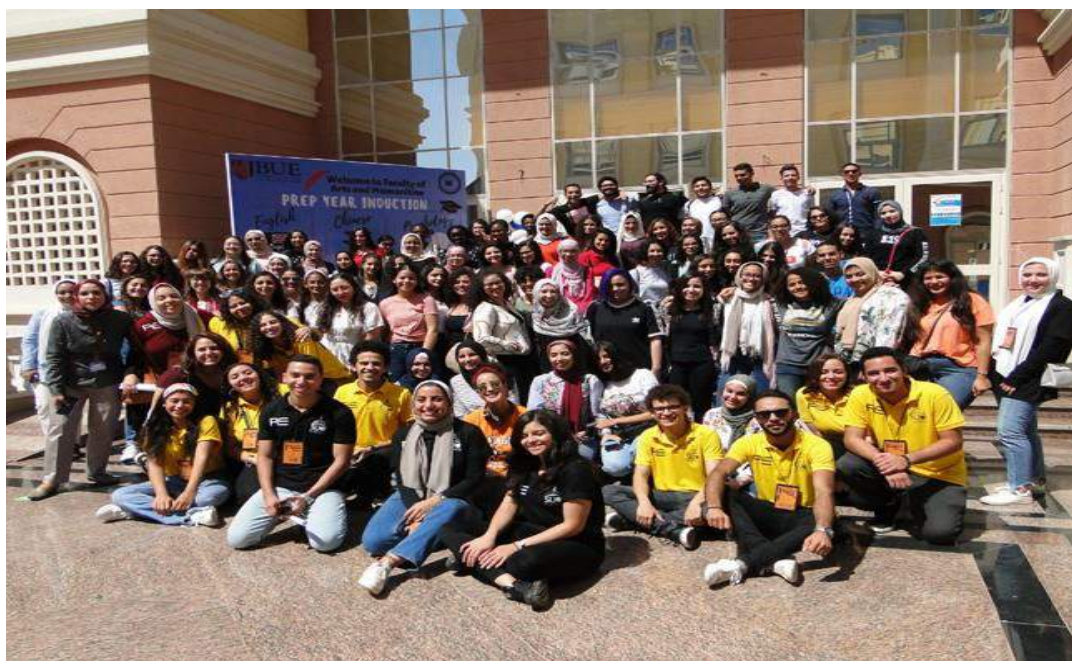
Welcome to the Faculty of Arts & Humanities

Graduates will also be well prepared to pursue post-graduate studies in top-ranked universities, perform to high standards in academic positions and acquire leading roles in outstanding universities around the globe.