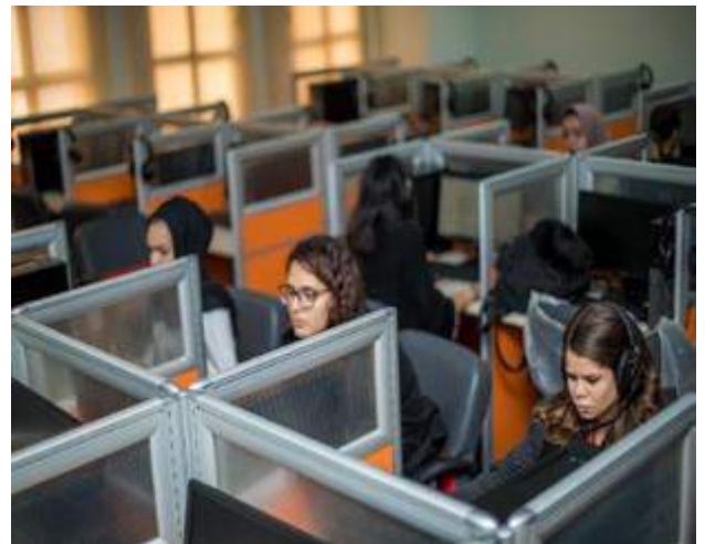
Student Lab Project.